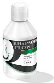
RHAPSODY FLOW MINT

Flavor: barberry Set: 300 g bottle REF: BB0300RF000