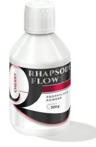
RHAPSODY FLOW CHERRY

Flavor: fruits Set: 300 g bottle REF: TP0300RF000