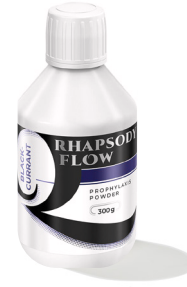
RHAPSODY FLOW BLACK CURRANT

Flavor: mint Set: 300 g bottle REF: ME0300RF000