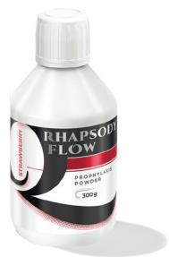
RHAPSODY FLOW STRAWBERRY

Flavor: cherry Set: 300 g bottle REF: CH0300RF000