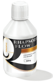
RHAPSODY FLOW TROPIC

Flavor: lemon Set: 300 g bottle REF: LE0300RF000