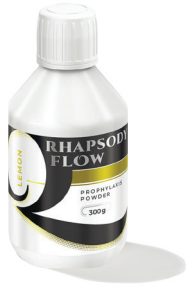
RHAPSODY FLOW LEMON

Flavor: neutral Set: 300 g bottle REF: NE0300RF000