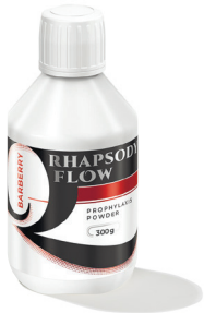
RHAPSODY FLOW BARBERRY

Flavor: strawberry Set: 300 g bottle REF: SB0300RF000