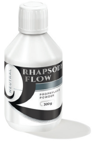
RHAPSODY FLOW NEUTRAL

Flavor: neutral Set: 300 g bottle REF: NE0300RF000